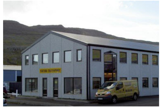
Safari Transport location in Tórshavn